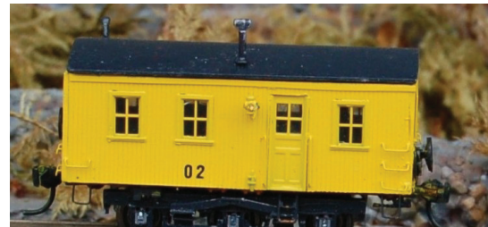
622H0002 Single truck cabooses, inspired by Walther's "Oscar" Production door in center of car. BCW early Pullman Truck, KD couplers. Special order only.