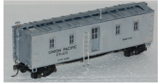
640H4821 Overland style bunk car. Similar to style used on many mid-West railroads.