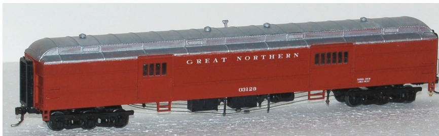
670H1885 Athearn 1880 baggage car with new underframe and detailing parts, KD wheel sets and couplers. Branchline / PSC underframe and detail parts, AML diaphragms. This model custom-built for customer.

Credit Card or pre-paid orders over $50.00 net, receive free USPS parcel post mailing. Priority Mail please add $5.95