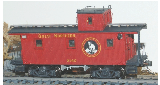
625H0111 Regular cupola cabooses with truss rods. GN series X-002 to X258. Various styles within this series. Complete kit Marker lighting kit available DC/ DCC, 625H7425.