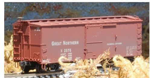
40 ft. Truss rod tool car with special end-of-car parts from BTS. Kadee Trucks, Tichy K-2 and grabs, Grandt Line doors.