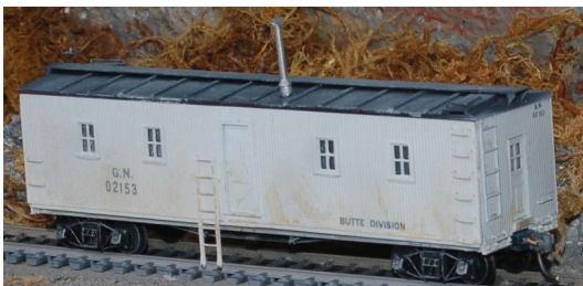
640H4803 Truss-rod bunk car kit modeled after GN cars At home on any work train.

Note: If lighting kits are desired for the 640 series work cars cars, please ask for substitute Bethlehem Car Works (BCW) Arch bar or Andrews trucks. ($1.00 additional charge)