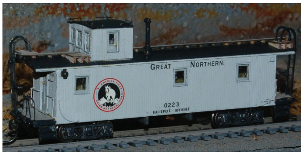
633H0121 PC&F 33 ft. cabooses kit. Curved ladders. Complete kit features all necessary parts. BCW trucks, KD couplers. Marker lighting kit available, DC / DCC 625H7425.