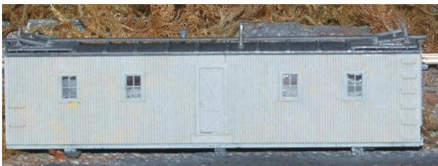
640H4851 Stationary bunk car kit modeled after cars used at Nampa, Idaho and Cheyenne, Wy. by P.F.E. NP cars at Pasco, WA and Livingston, MT had round roofs.