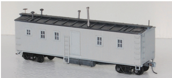
640H4812 Shower-Recreation Car. Modeled after popular mid-West railroad, car captures feel of hard working men.