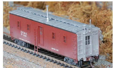
640H4829 Round roof bunk car similar to those used by both the NP and SP&S railroads.

Note: If lighting kits are desired for the 640 series work cars cars, please ask for substitute Bethlehem Car Works (BCW) Arch bar or Andrews trucks. ($1.00 additional charge)