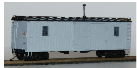
640H4863 Window Tool car, modified SUF. Accurail Andrews trucks, Kadee wheel sets. Grandt Line, Tichy, PSC detail parts