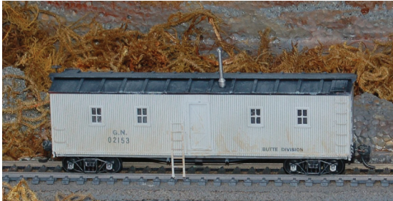
640H4801 Bunk car kit modeled after GN cars