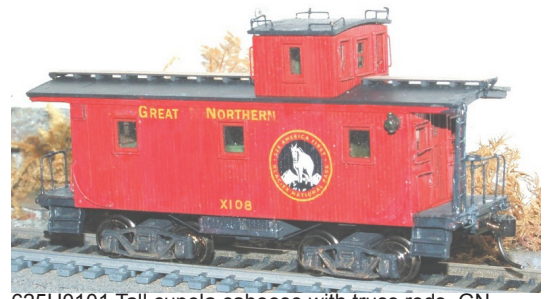
625H0101 Tall cupola cabooses with truss rods. GN series X-002 to X258. Various styles within this series. Complete kit Marker lighting kit available DC/ DCC, 625H7425.

Not Shown: Standard cupola cabooses with curved top end ladders. Kit 625H0131, $59.95