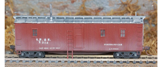
640H4834 Six window formans or office car. Option to construct with open rather than fishbelly underframe.