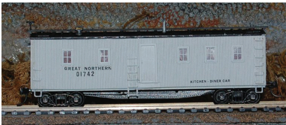
640H4805 Kitchen-Diner car kit. Similar cars operated nation-wide